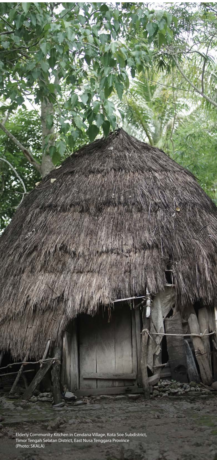
Elderly Community Kitchen in Cendana Village, Kota Soe Subdistrict, Timor Tengah Selatan District, East Nusa Tenggara Province

Despite these challenges, the integration process has delivered significant benefits.